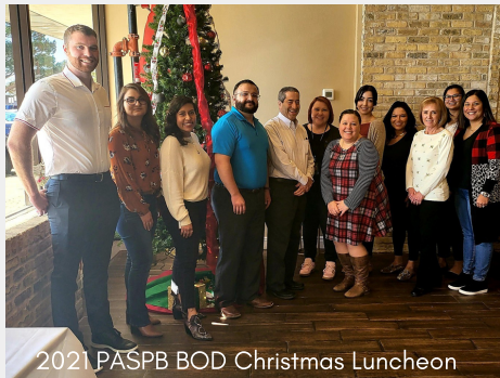
2021 PASPB BOD Christmas Luncheon