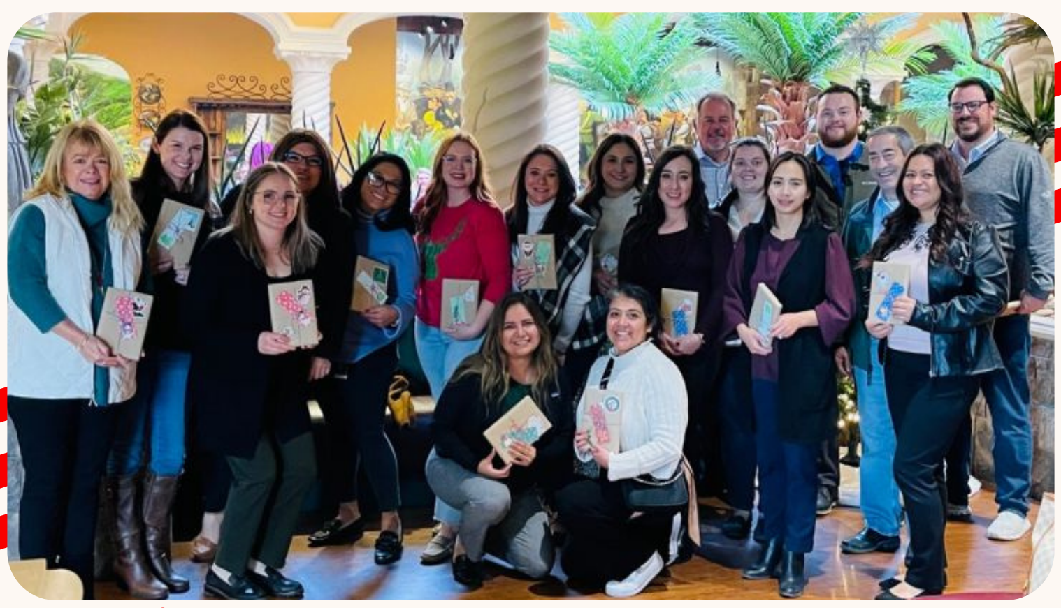
PASPB Board of Directors, Committee Chairs, and past presidents