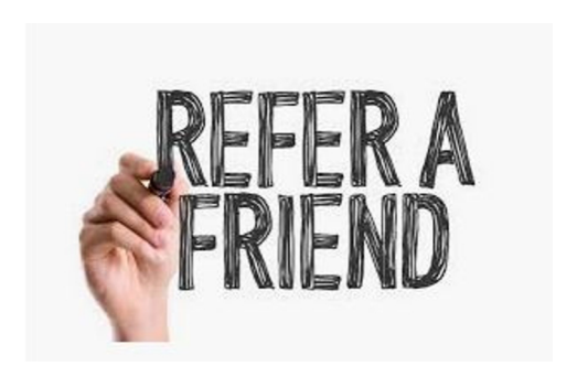
Sign Up Here